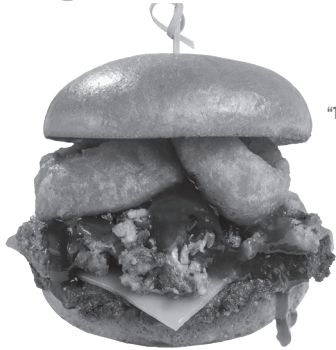
Try "The Big Nasty" Burger!

Fresh cuts of select beef, hand-pressed onto our flat-top grill for that "old-school" crispy-juicy grilled burger "WOW."