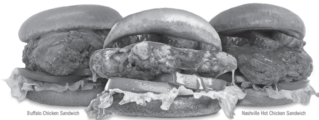
Buffalo Chicken Sandwich